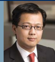
Aquico Wen Esemplia Emerging Markets

"If your international shares allocation does not include emerging markets, you could be missing out on the exact regions that offer the most promising and rewarding economic growth prospects"