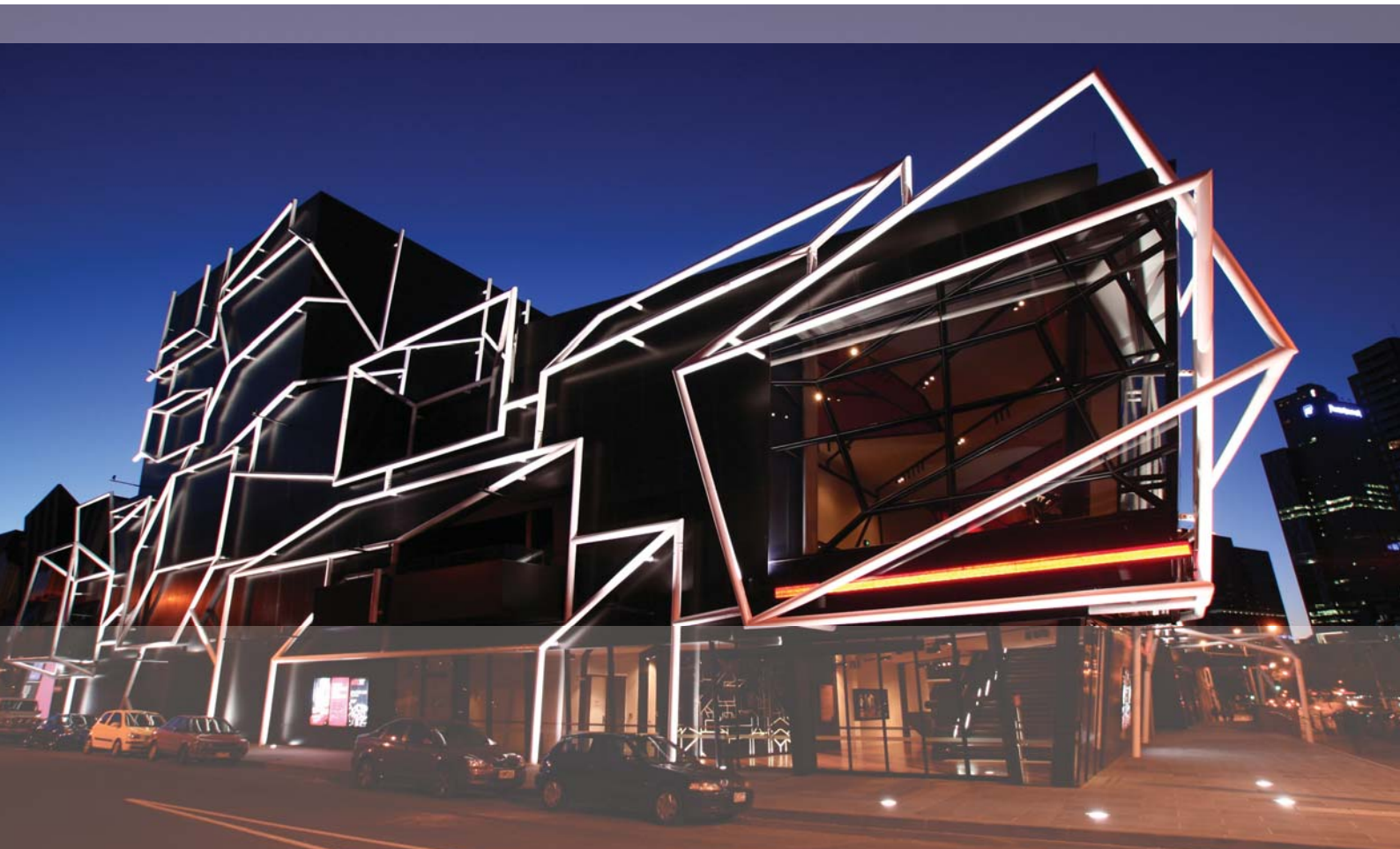
MELBOURNE THEATRE COMPANY, MELBOURNE